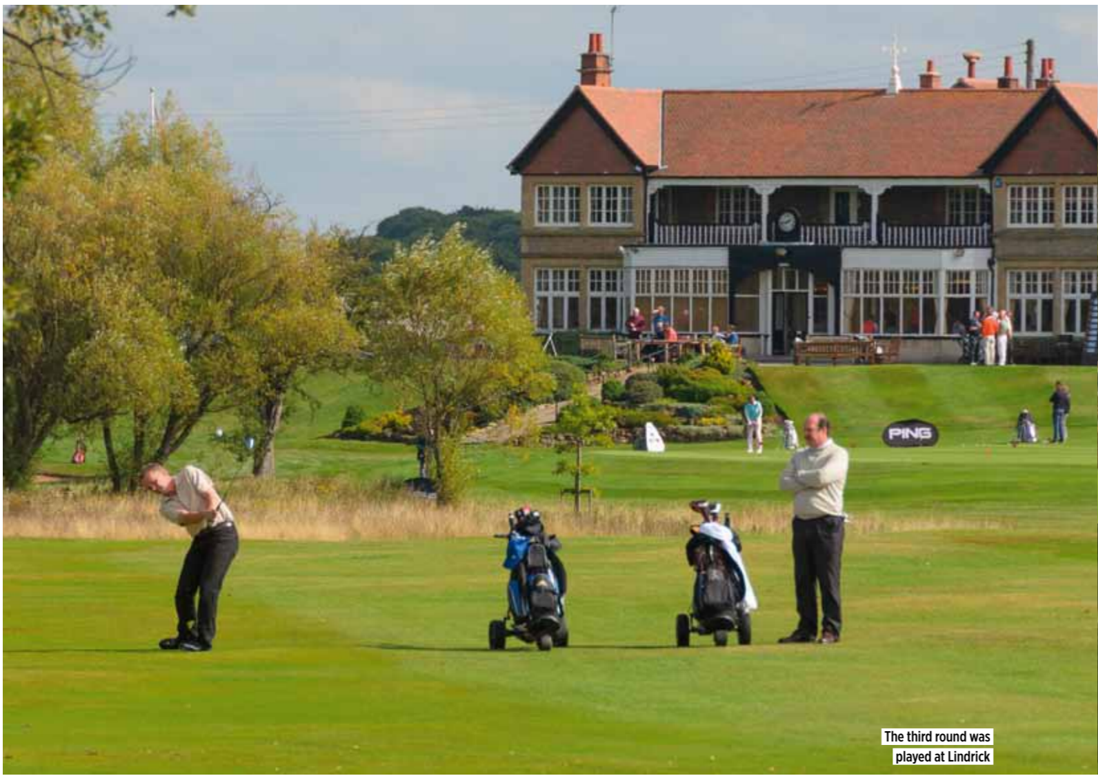
The third round was played at Lindrick