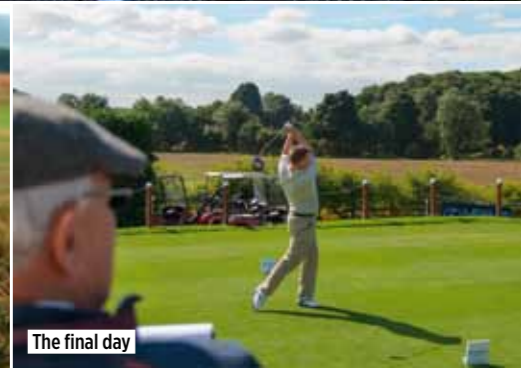
The final day