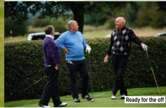
Ready for the off