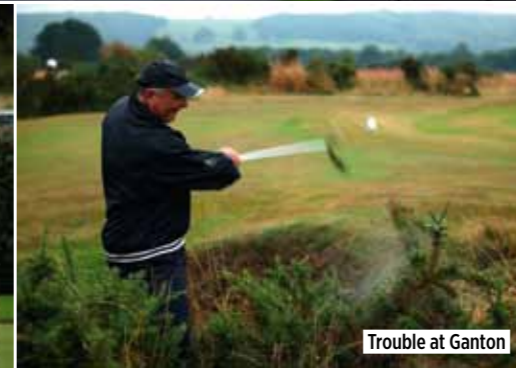
Trouble at Ganton