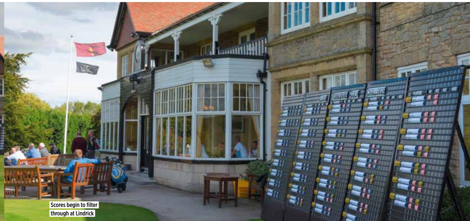
Scores begin to filter through at Lindrick